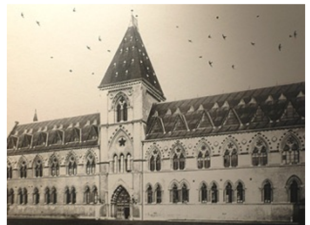
The swifts circling the Museum's tower

12 nestling meals collected near Oxford contained over 300 different species!