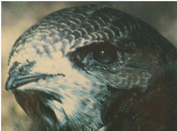
The European swift, Apus apus

The swift or 'devil bird' has a forked tail and a high-pitched screaming call, perhaps explaining its nick-name.